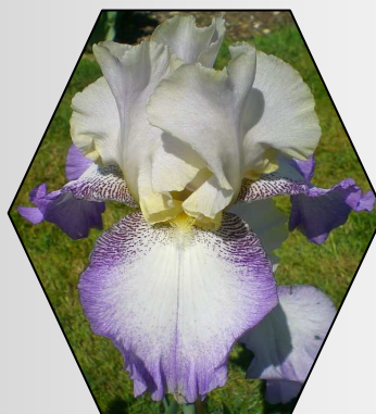
Foggy Dew 1969 Larger flowers, broader more rounded petals, slight ruffles