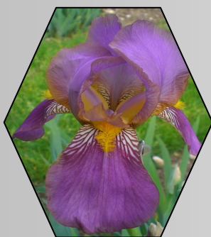
Evadne 1921 Small flowers, slender, drooping petals