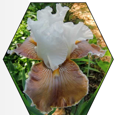
Coffee Whispers 1999 Large flowers, round, almost horizontally standing petals, heavy ruffles